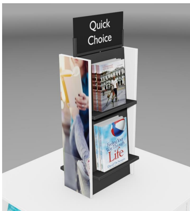
Table Topper for 4-Way Table