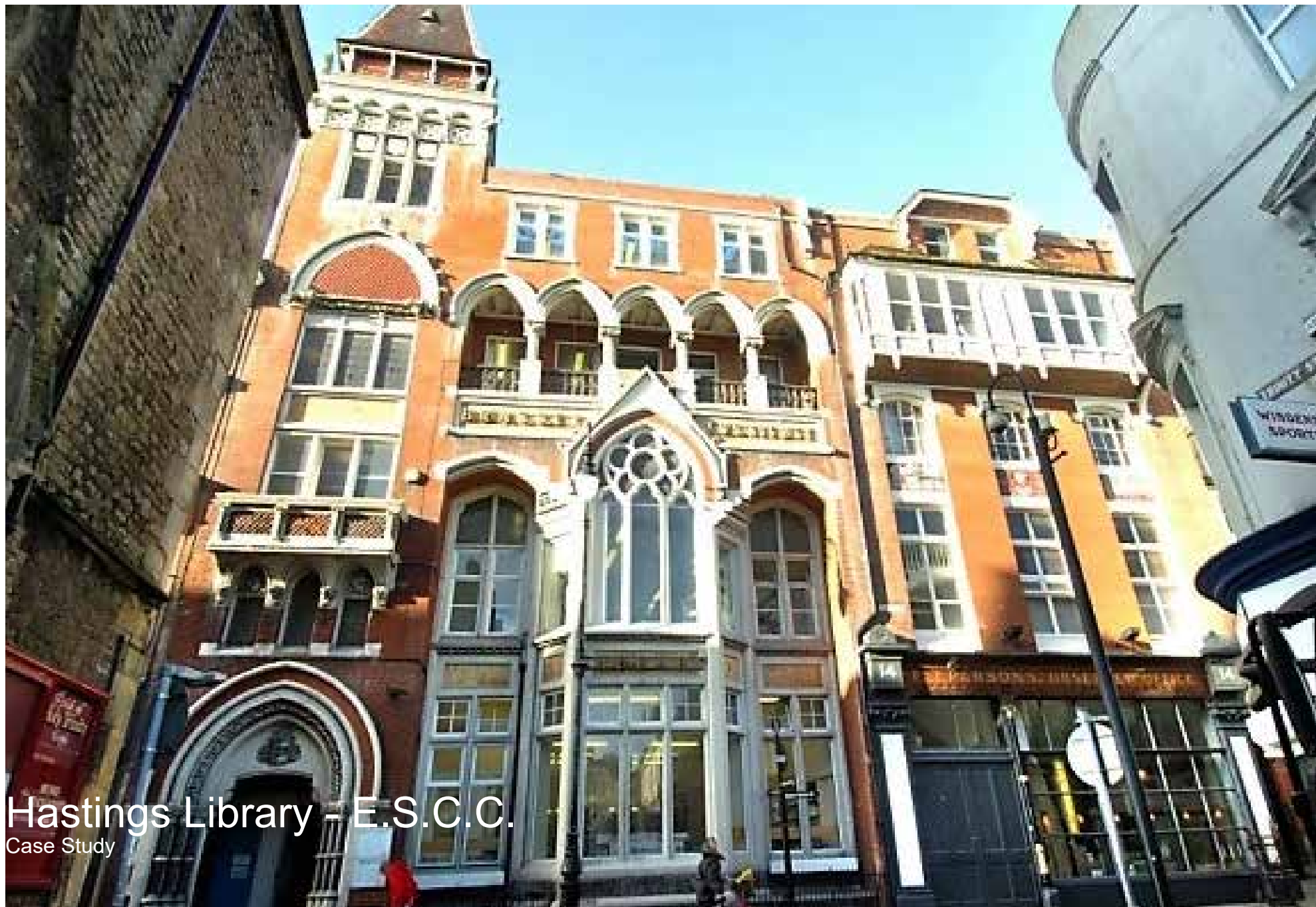
Hastings Library – E.S.C.C. Case Study